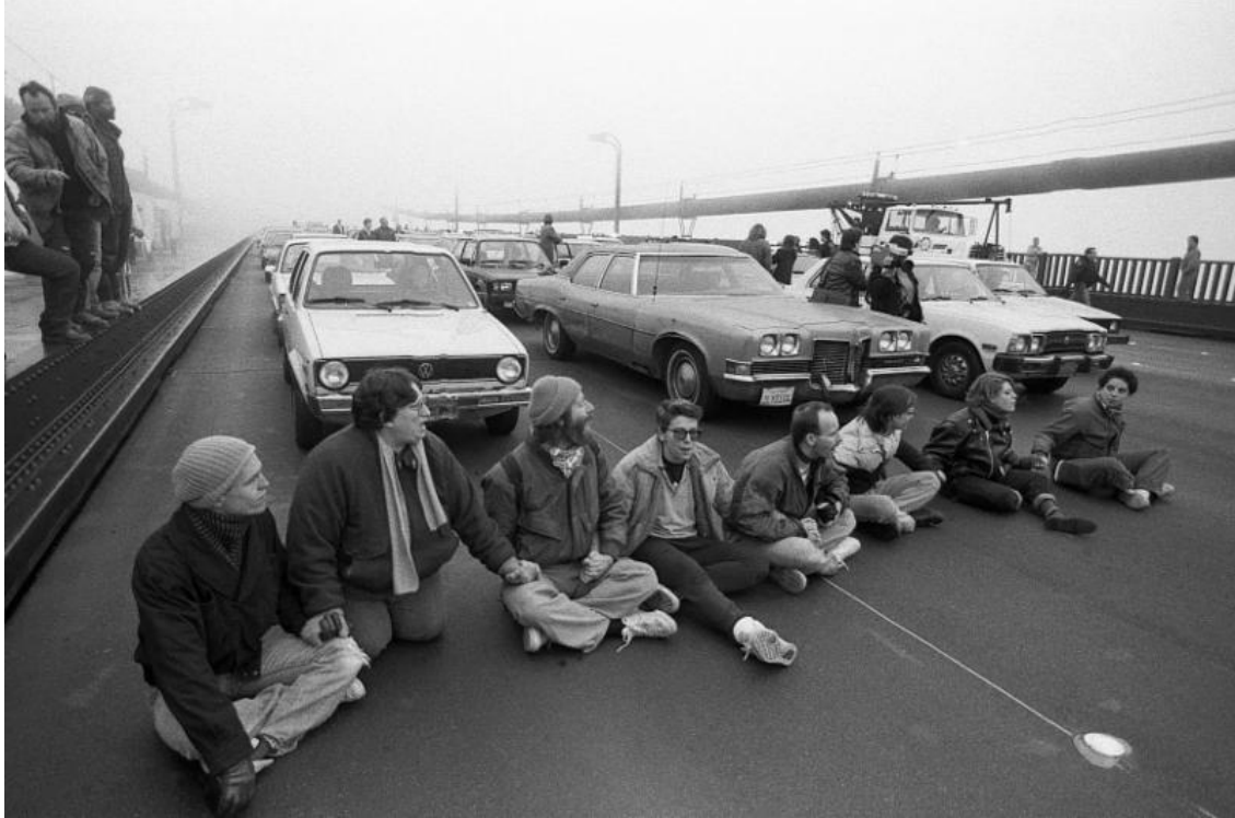
Activists from Stop AIDS Now or Else staged a sit-in on the Golden Gate Bridge during morning rush hour on January 21, 1989 -- the only time in history protesters halted traffic on the bridge.