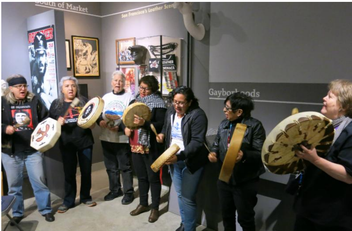
Members of Bay Area American Indian Two Spirits form a drum circle at the GLBT Historical Society Museum.